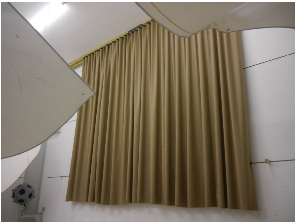
Figure B.2. Test object mounted in the reverberation room, diagonal view.

S:\MIP\Proj\129\M129035\M129035_01_PBE_1E.DOCX : 07. 06. 2016