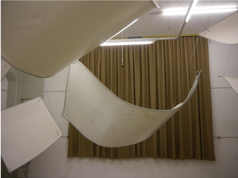
Figure B.1. Test object mounted in the reverberation room, frontal view.